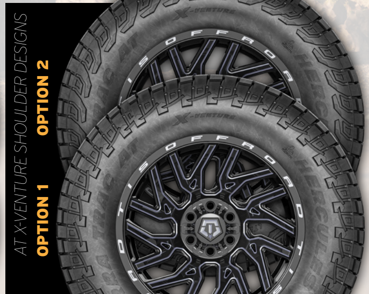
AT X-VENTURE SHOULDER DESIGNS OPTION 1 OPTION 2