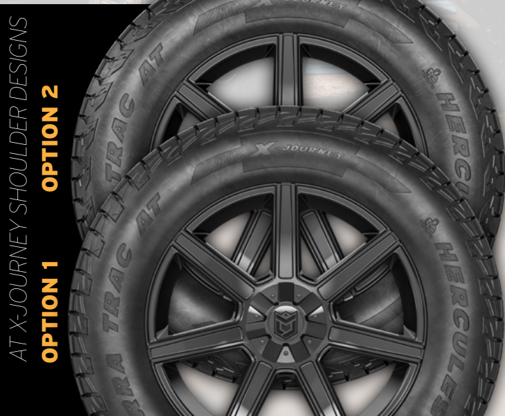
AT X-JOURNEY SHOULDER DESIGNS OPTION 1 OPTION 2